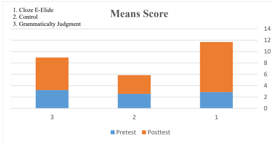
Fig. 1. Means of control and experimental groups before and after treatment