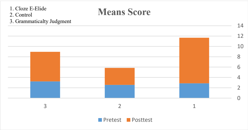
Fig. 1. Means of control and experimental groups before and after treatment

Table 4 displays the Multivariate M test. This table mostly emphasizes Wilks' Lambda. Wilks' lambda quantifies the effectiveness of each function in segregating situations into distinct categories. It is similar to the total amount of variation in the discriminant scores that cannot be explained by differences among the groups. Upon examining the interaction between the test and grouping, a notable distinction is evident (Value= 0.300, F= 101.473, Hypothesis df= 2.000, Error df= 87.000, p= 0.000). This distinction is accompanied by a substantial impact (Partial Eta Squared= 0.700), indicating that the test, acting as the within-subject factor, has influenced variations among the groups. The test results (Value= 0.179, F= 400.256, Hypothesis df= 1.000, Error df= 87.000, p= 0.000) indicate a significant effect, with a high effect size (Partial Eta Squared= 0.821).