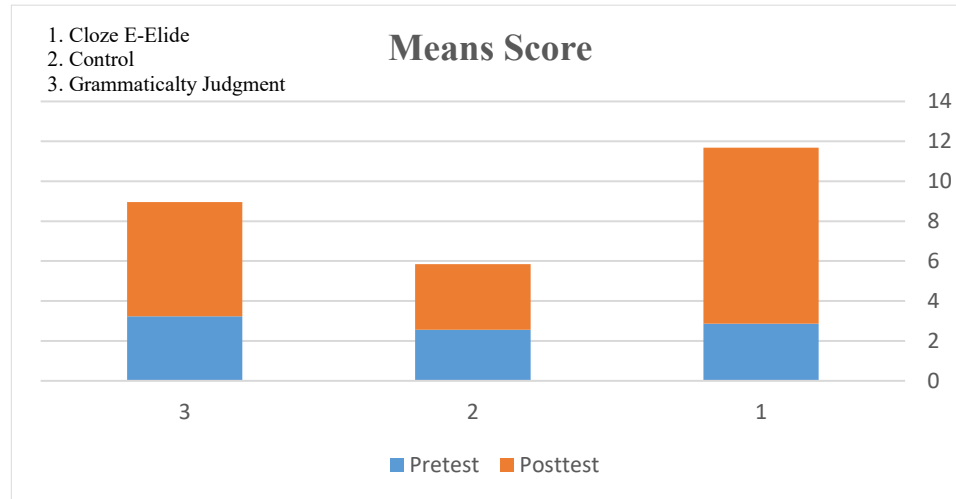
Fig. 1. Means of control and experimental groups before and after treatment